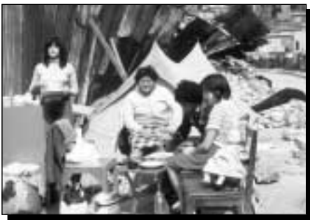
Disasters do not invariably result in food shortages.