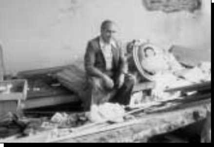
The psychological consequences of disasters tend to be far more pervasive and long-lasting than their physical ones.

After a disaster has struck, things do not return to normal in a few weeks. In fact, the economic, psychosocial and environmental consequences may become long-term disasters in their own right and their effects may last for years.