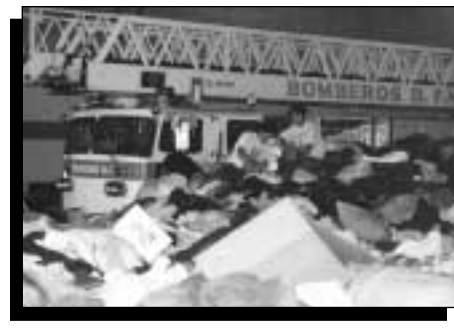
International assistance which does not complement the national effort can result in chaos.