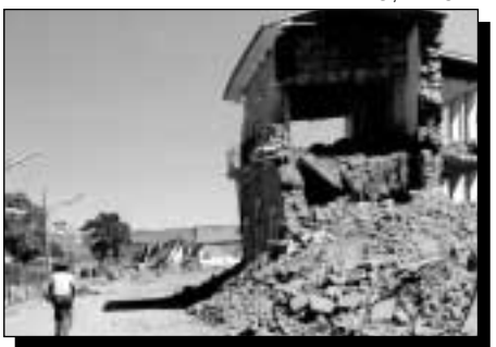
The effects of a disaster are long-lasting and do not just fade away within a few weeks like international interest usually does.