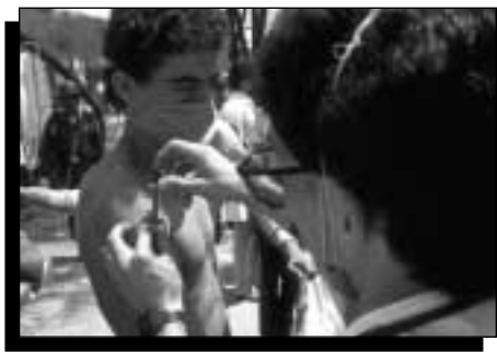
Epidemics and plagues are not inevitable after every disaster.