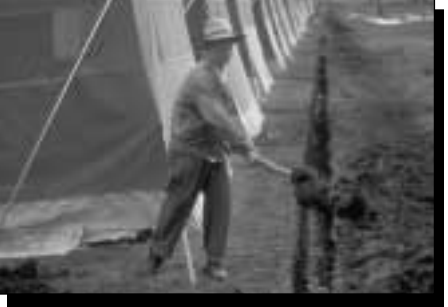
Assisting people to rebuild while they remain within their neighborhood and close to their neighbors is economically and emotionally cheaper than relocation to temporary settlements.

Each disaster has its own unique effects on food supply. For example, floods may destroy crops and food stores while earthquakes hamper the distribution of such supplies.