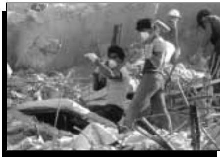
Disasters do not invariably bring out the worst in human behavior.